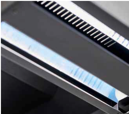
■ LED lighting system for reflection-free and shadow-free results