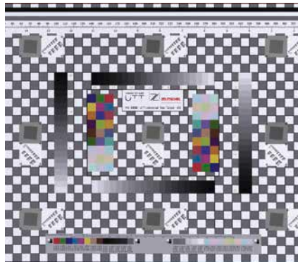
■ fulfills ISO 1964 / Quality Level A, Full Metamorfoze and FADGI****