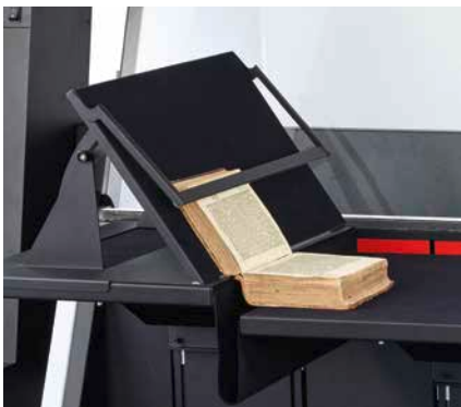
■ Bookholder on Copyboard OT 180 H 35 XL