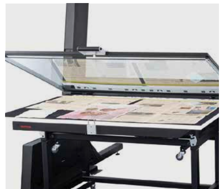
■ Toplight Table AT 0 with opened glass plate