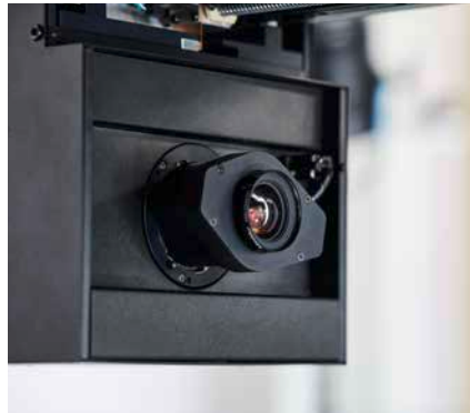
■ Camera system based on a CMOS sensor with optional optical zoom