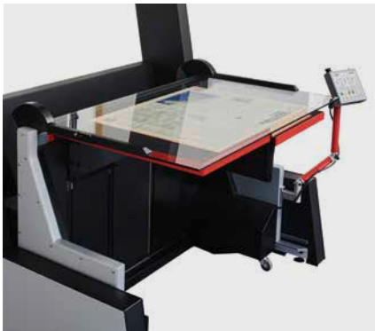
■ wide range of interchangeable copyboard systems