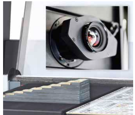
■ high depth of focus - electronic shutter