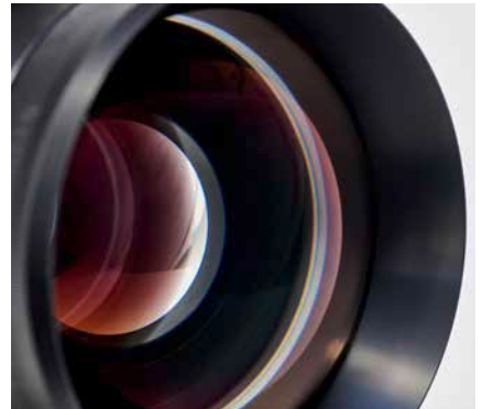
■ Perfect interplay between high-quality technical components